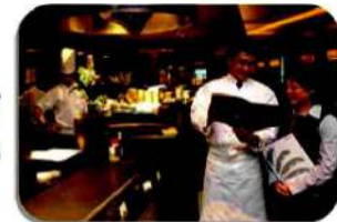
Hotels / Catering Companies