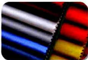
Textile & Garments