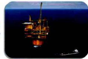
Oil & Gas Industry