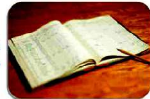
Account & Finance