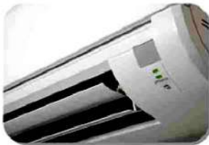
Air-Conditioning & Refrigeration

We have been recruiting Professionals, Managers, Engineers etc to the following industries: